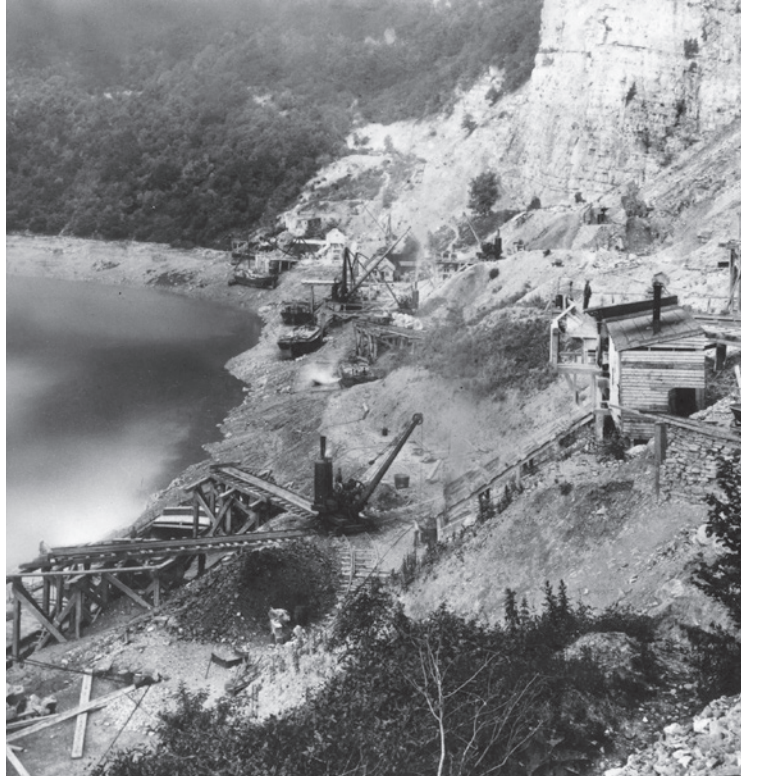
This old photo shows the quarry.

Keep straight on under the footbridge and through a kissing gate. At the road turn left and cross the road, walking along the roadside for a short distance. To avoid the road keep on the grass path and cut the corner off at Fox Hollies. Turn left at the 'Lancaut ¾' sign and continue along this road, passing 'Spital Meend' on your right and soon after the peregrine sculpture and car park on the left (6).